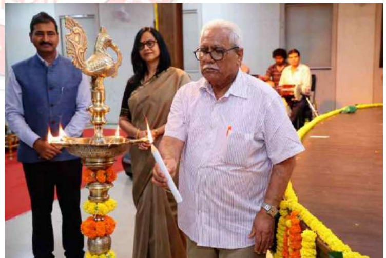
Lighting of lamp by GM, SDGM & GS/WREU