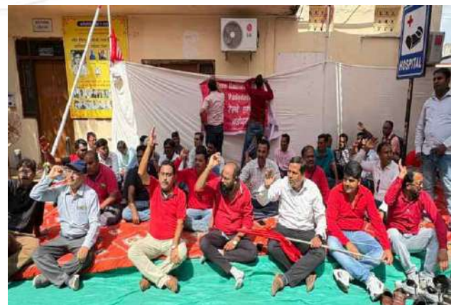
Demonstration for long pending demands on 6th October 2025 at Pratapnagar Divisional Office, Vadodara.