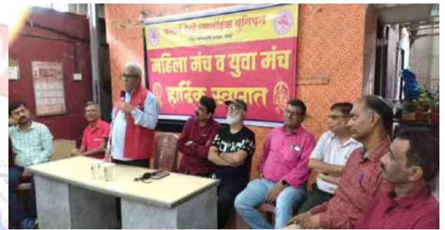
Protest on 19/09/2025 at PL/MX Workshop Branch