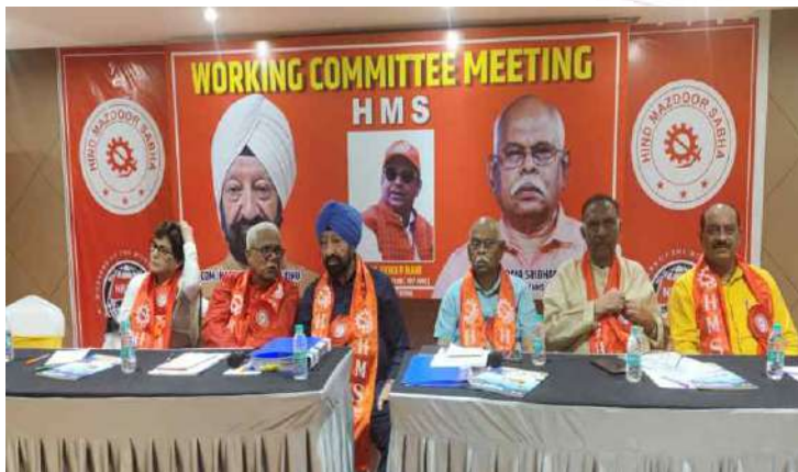
HMS Working Committee Meeting at Madgaon