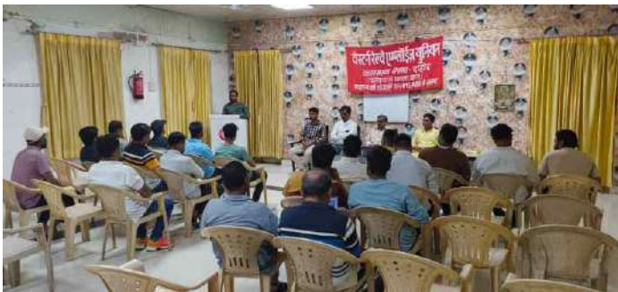
Conclusion of Training Class for JE aspirants by WREU-Dahod Workshop Branch