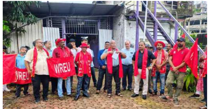
IOW-I/II & S&T Workshop-BCT