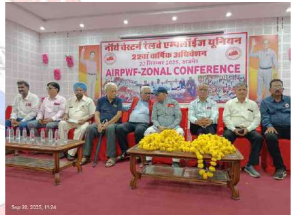
AIRPWF Zonal Conference