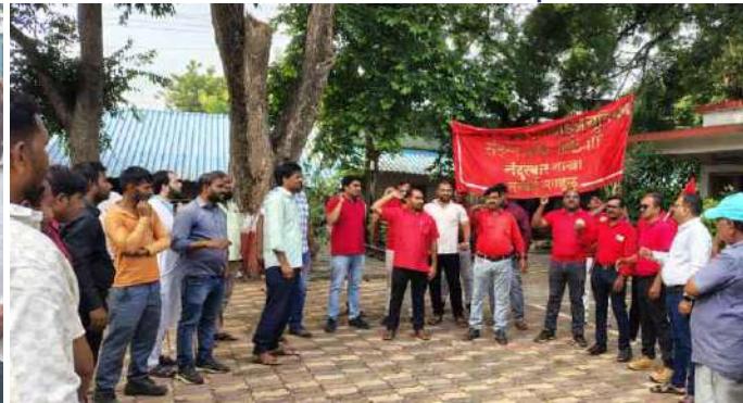
Nandurbar Mumbai Division