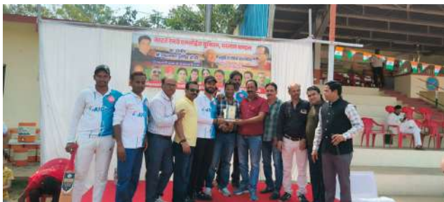
Ujjain Branch of RTM Division organized Umraomal Purohit Cricket Tournament.