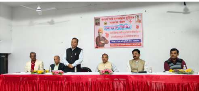
Blood donation Camp held in Rly. Community Hall at Bhavnagar