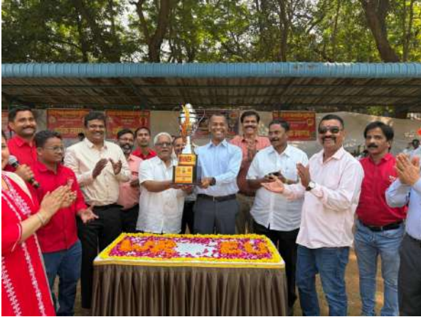
Unveiling of Trophy by DRM-MMCT