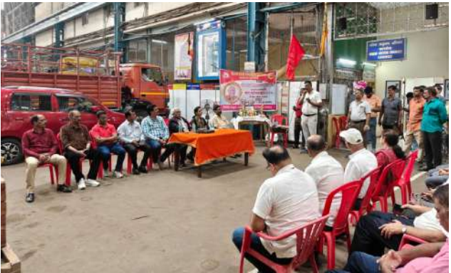
Krida Mahotsav organized by Carshed Branch-Mumbai Central