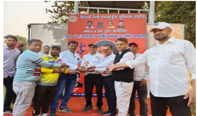
Late Com. Umraomal Purohit Cricket Tournament conducted by Dahod Workshop.