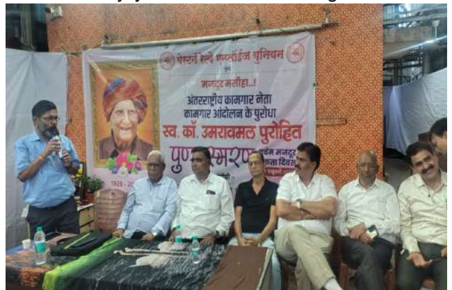
Shradhanjali Sabha & Mazdoor Ekta Diwas at PL Workshop