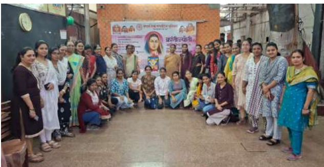
Kranti Jyoti Savitribai Phule Jayanti observed in PL Workshop