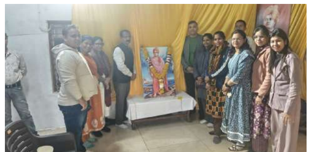
Swami Vivekanand Jayanti & National Youth Day observed by RTM Division.