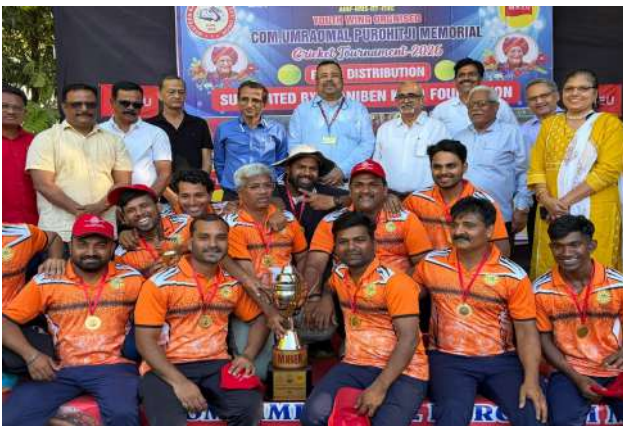
Group Photo of Winner Team – Lokadhikar Samiti-XI – EMU/POH/MX