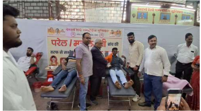
Blood donation Camp held at PL Work shop.