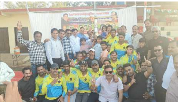
Umraomal Purohit Tennis Ball Cricket Tournament-RTM from 23rd to 28th Feb. 2026.