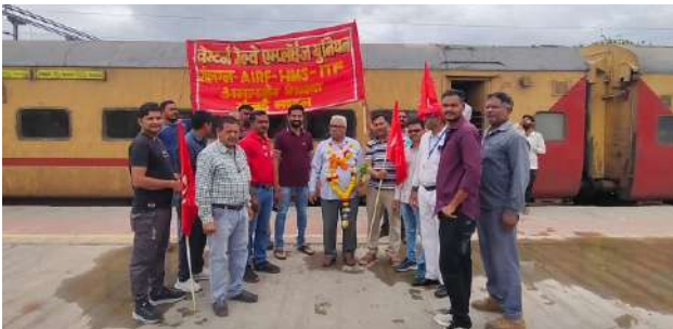
General Secretary welcomed by team Amalner