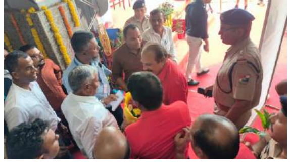
Team WREU Valsad welcomed Hon'ble MOSR Shri V. Somanna on 26.05.2025