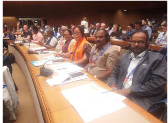
113th ILC of ILO at Geneva