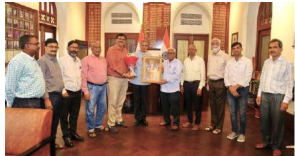
WELCOME TO SHRI DHARMENDRA MEENA, GM-WESTERN RAILWAY