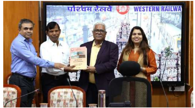
Launching of informative book on Avenue of Promotions