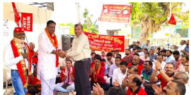
Successful Token Fast Agitation by WREU Palanpur