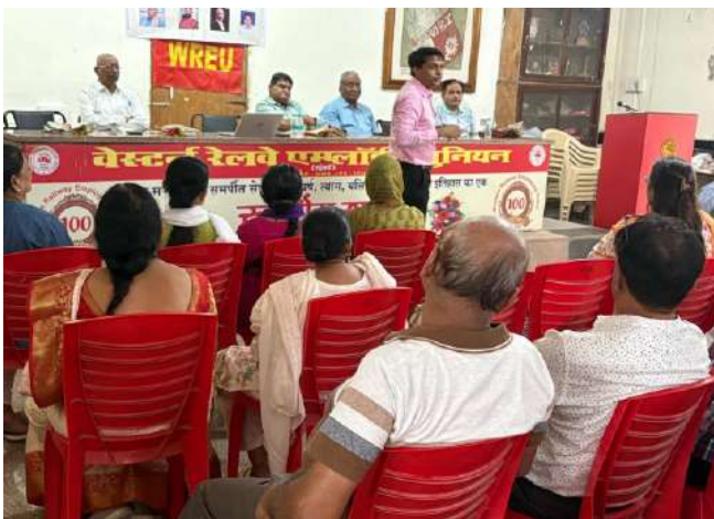
Lecture on Cyber Crime- 1st Foundation Day of AIRPWF