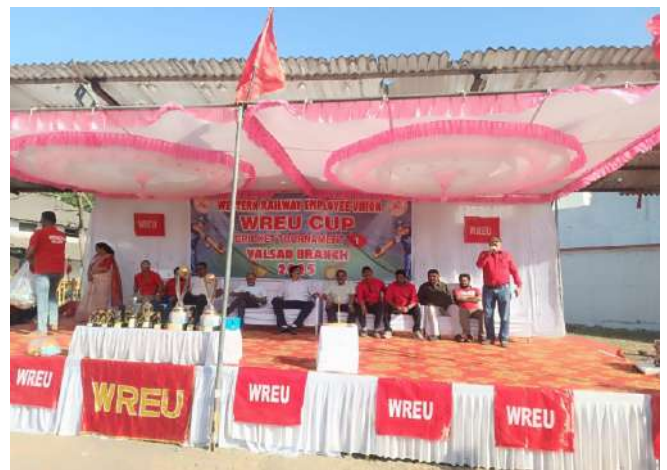
Cricket Tournament held at Valsad