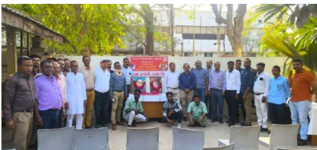
Celebration of Jyotiba Phule Jayanti and Dr. Babasaheb Ambedkar Jayanti Ahmedabad Division