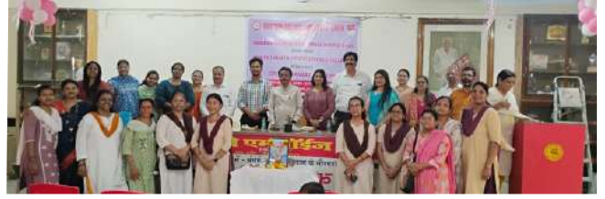
WREU J. A. Sabhagruh Grant Road