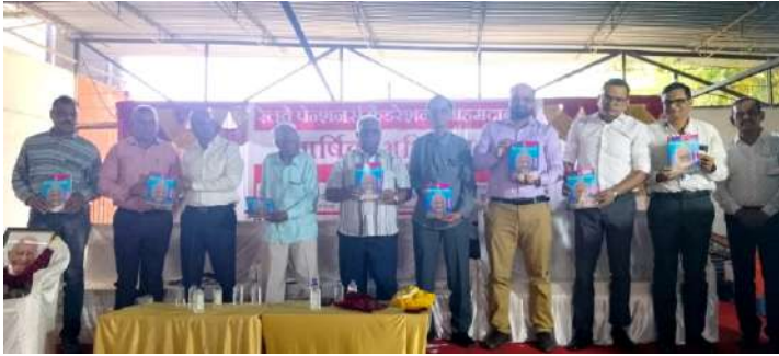
22nd AGM of Railway Pensioner's Federation Ahmedabad