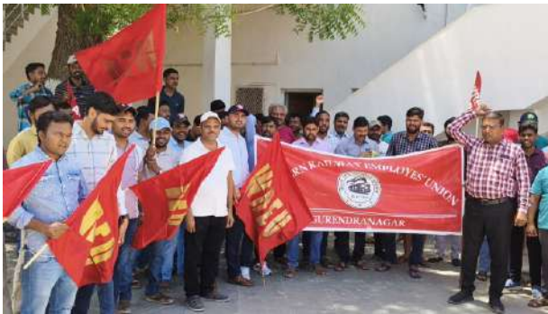
Huge Protest against Report of Multi-Disciplinary Committee, Rajkot & Ratlam Divisions