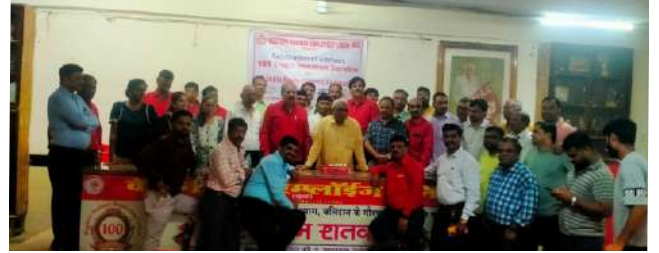
AIRF 101st Foundation Day