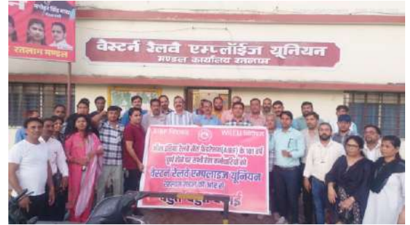
101st Foundation day of AIRF, Ratlam Division