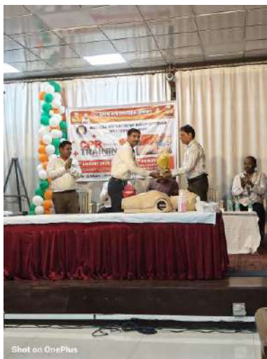
CPR TRAINING CAMPS BY EMU-POH/MX