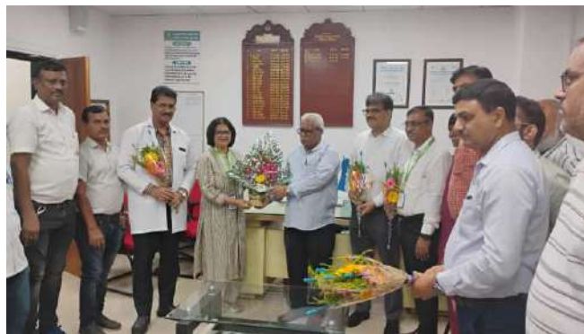
NATIONAL DOCTORS DAY