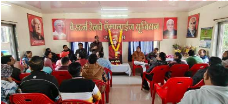
Vivekanand Jayanti – RTM Division