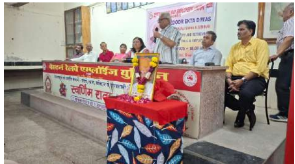
WREU observers Mazdoor Ekta Divas on 27.02.2025 at Mumbai.