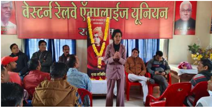
Vivekanand Jayanti – RTM Division.