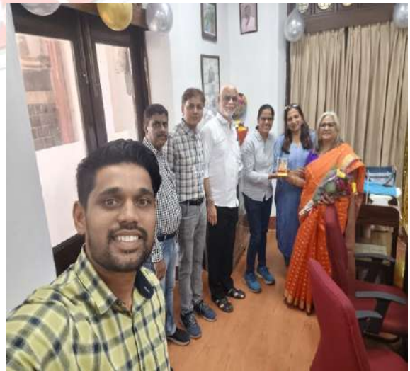
Til Gud function and get-together – GLO Branch, Churchgate.