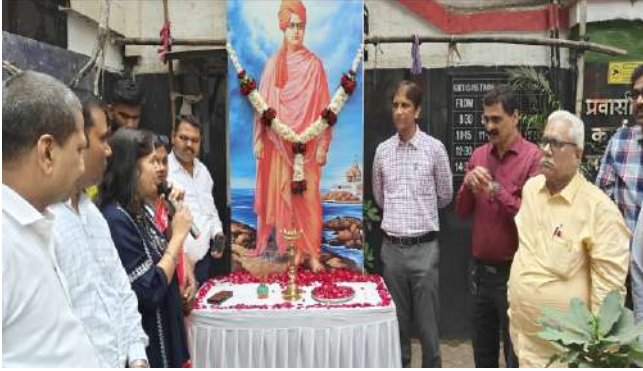
Inauguration of Blood Donation Camp in presence of GS/WREU & CWM-PL.