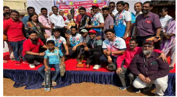
Umaraoal Purohit Memorial Cricket Tournament – BCT Division.