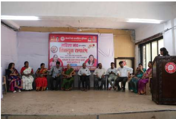
Til Gud Samarambh – PL Workshop.