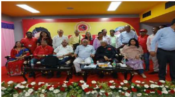
Working Committee Members of WREU & NRMU (C.Rly.) with top leadership of AIRF.