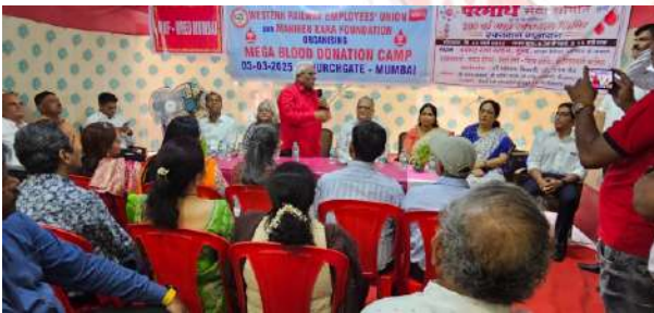
Megha Blood Donation Camp at Churchgate Station on 3rd March, 2025.