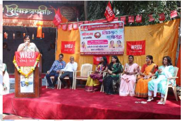
Til Gud Samarambh – EMU/POH Workshop.