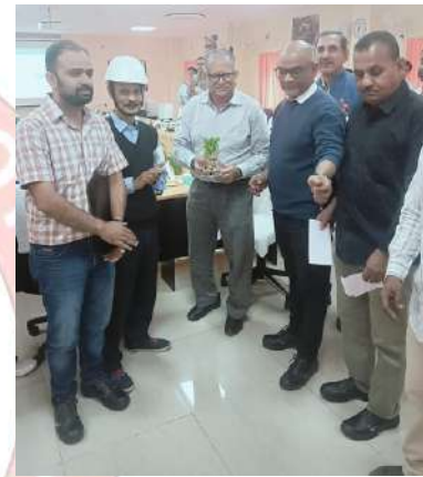
WREU PRTN Work-shop – handing over Memorandum to GM.