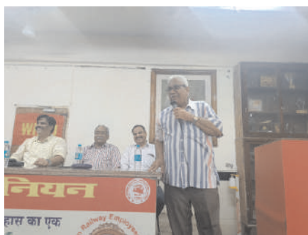
MEETINGS AT CHURCHGATE & GRANT ROAD