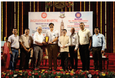
GM/Western Railway felicitated WREU on World Blood Donation Day