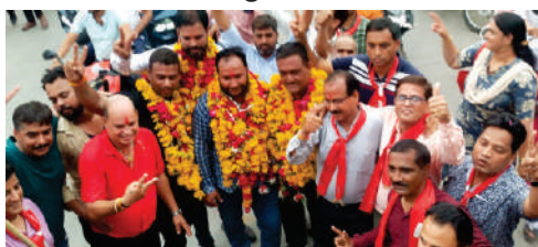
WREU won Sr. & Jr. Institute Election at Ratlam