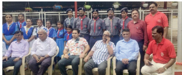
12th July, 2024 – Tree Plantation and Meeting.