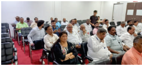
HMS National working committee meeting at New Delhi.