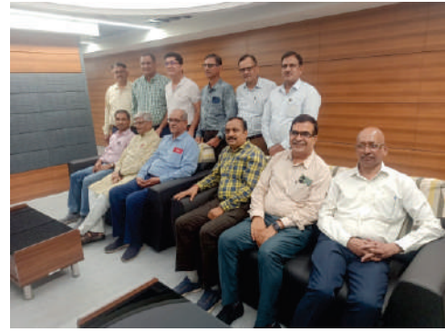
GS/WREU & GS/AIRF visited DFCCL Control Room, Ahmedabad.