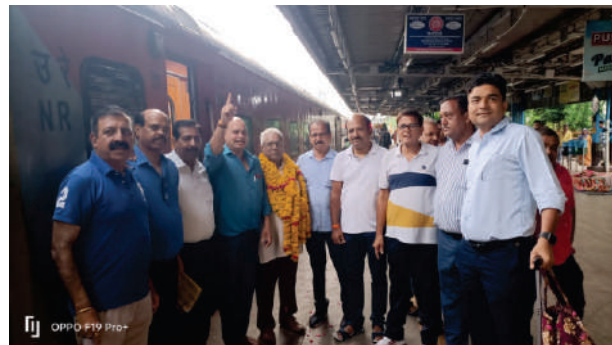
Warm Welcome to Bhosaleji at RTM Station.