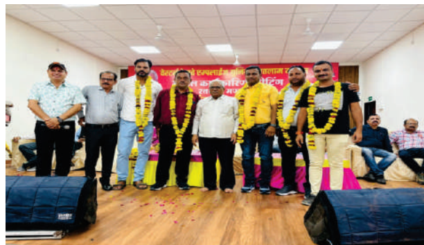
DEC Meeting at Ratlam