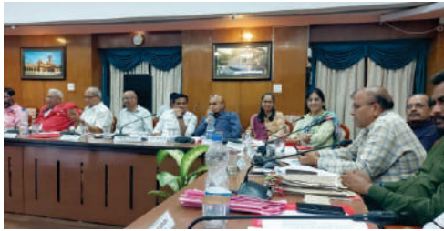
GM PNM Meeting 21st & 22nd August, 2024