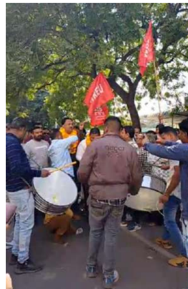
Victory Celebration By WREU/RJT