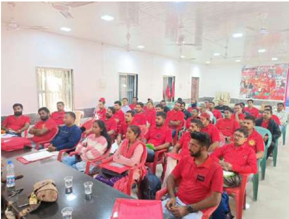
TUEP of Mumbai Division at Valsad