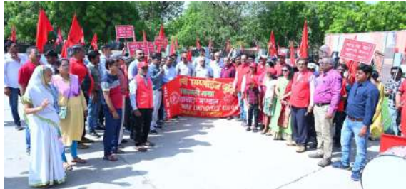
← Grand Procession