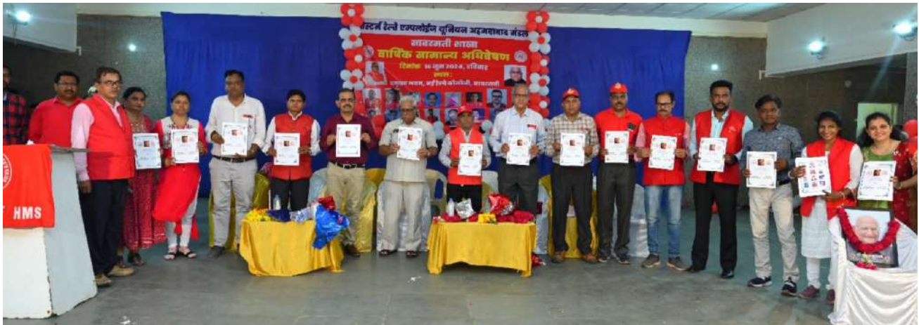
Annual General Meeting – Releasing of Souvenir