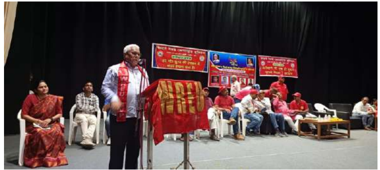
Spontaneous Gate meeting at Locomotive Care Centre – Ratlam