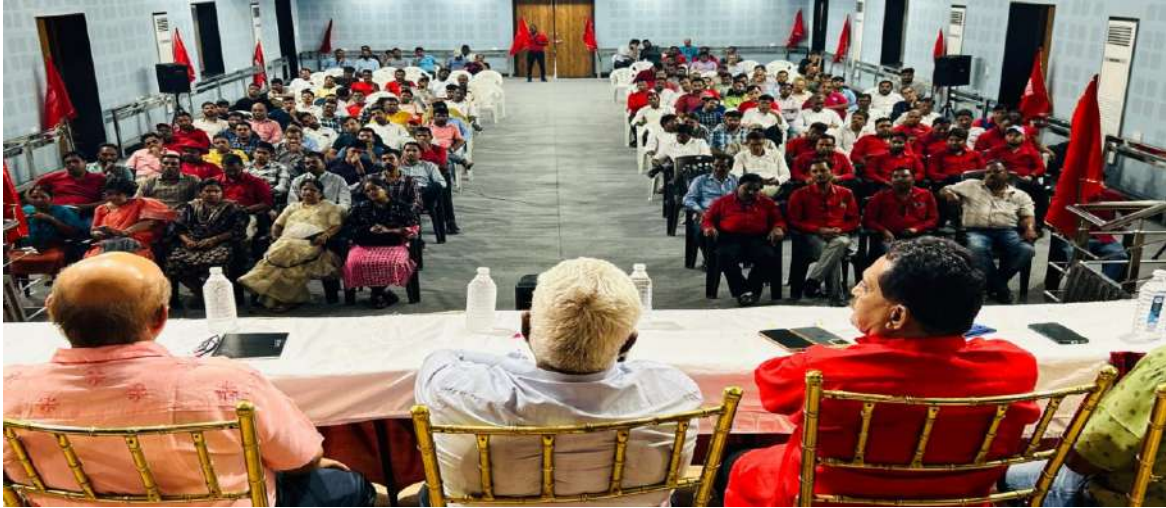
DEC Meeting of Vadodara division in PRTN Auditorium.