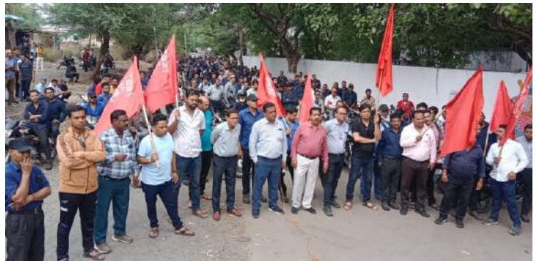
Celebration of 50 years of Historic Railway Strike on 8th May, 2024.