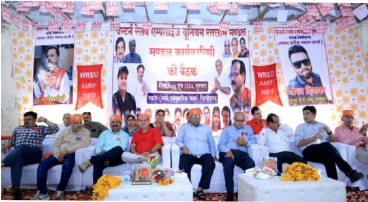
DEC Meeting of Ratlam division at Chittaurgarh.