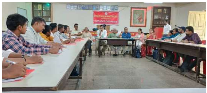
Innauguration of trade union education program at GTR Mumbai 30th Oct. to 1st Nov. 2023