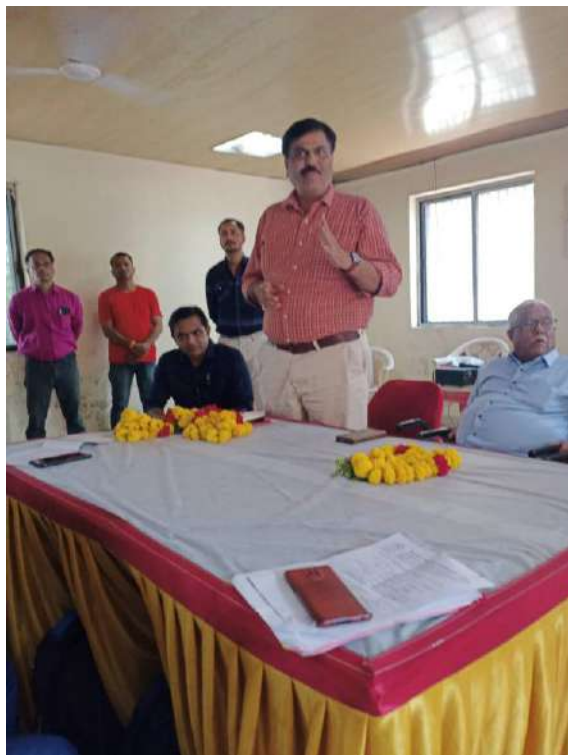
Trade union education program at union office Vadodara on 25-27 Oct. 2023