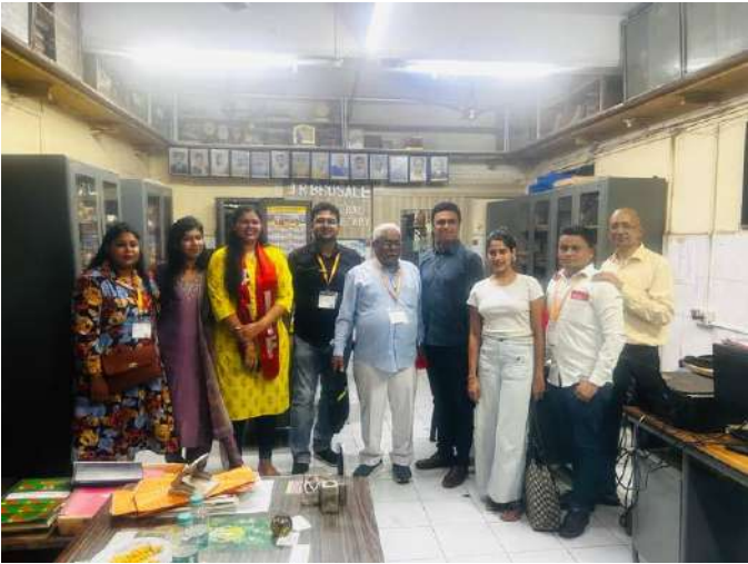
Participants of "strategy discussion on well being project held in WREU GTR office on 18th Oct. 2023- all peer educators