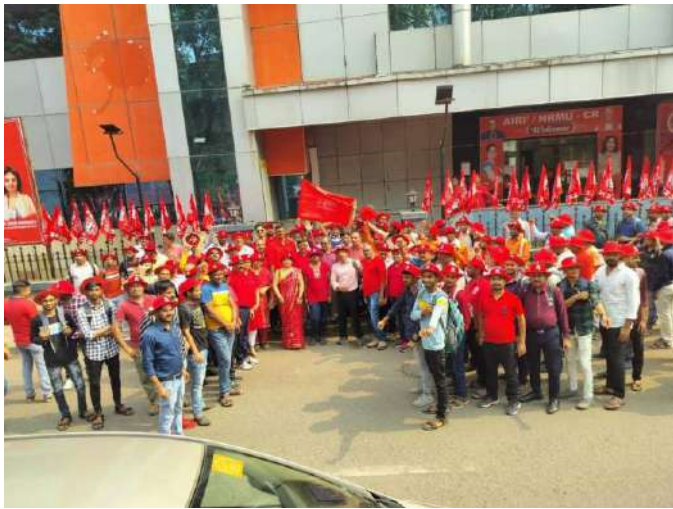
WREU's enthusiastic youth comrades gathered outside Shanmukhanande Hall Mumbai before participating in ITF Global Youth Conference on 17th Oct. 2023