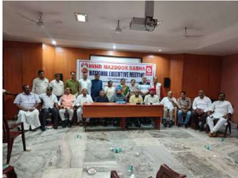
National executive meeting of HMS at Kanyakumari on 16-17 Sept. 2023