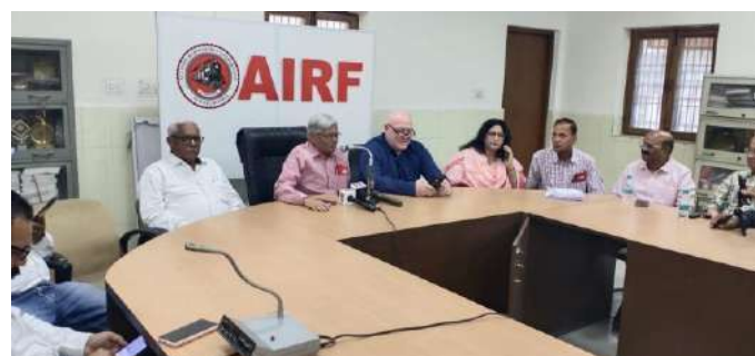
AIRF/ITF leaders addressing the Press Conference on 22.04.2024.