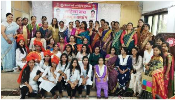
PL- MX Work shop Branch .