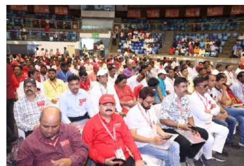
AIRF Youth Session at Talkatora Indoor Stadium on 23.04.2024.