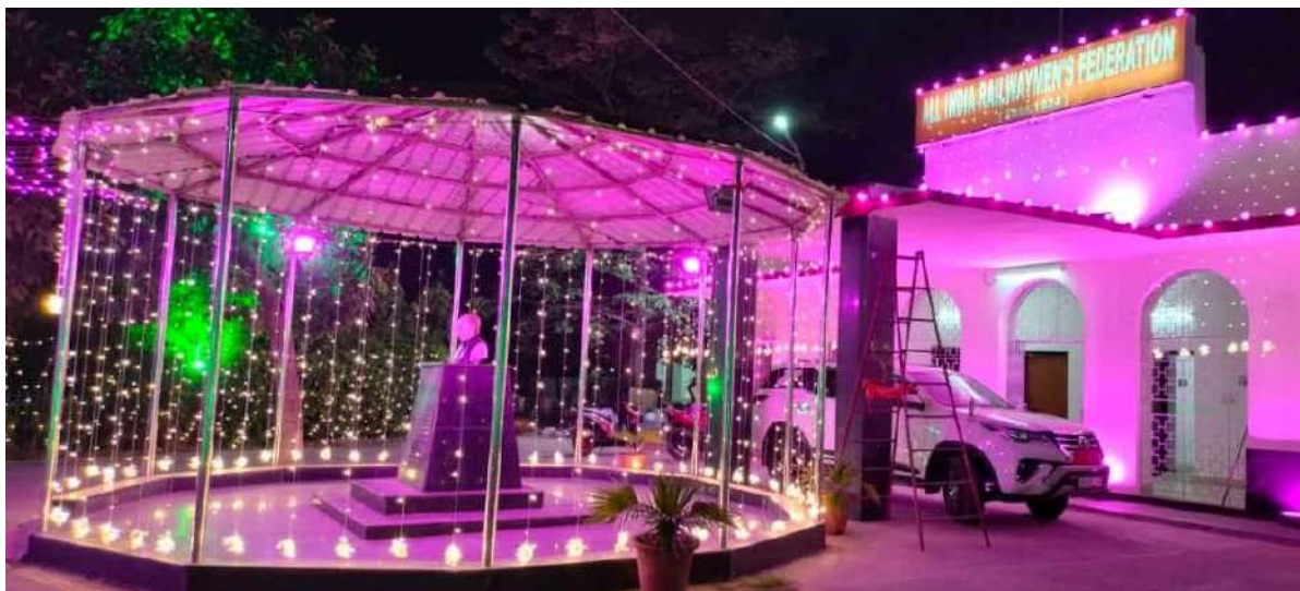
Galilee decorated AIRF Office at State Entry Road, New Delhi.