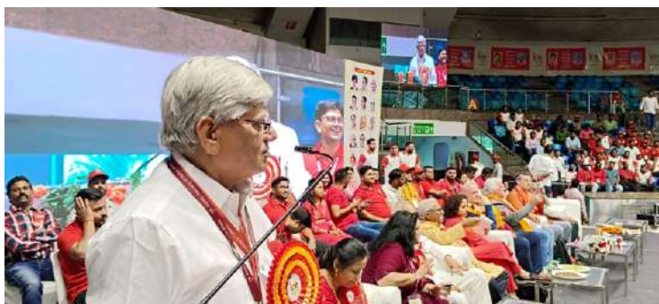
AIRF Youth Session at Talkatora Indoor Stadium on 23.04.2024.