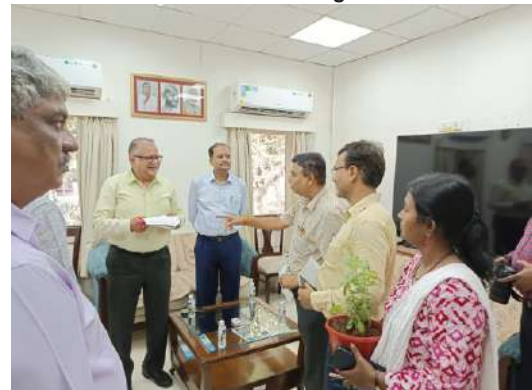
PL – MX Work shop Branch handing over Memorandum to General Manager.