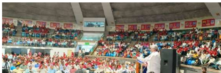
Huge gathering of Youth and Women at Talkatora Indoor Stadium.