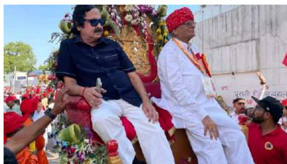
President and General Secretary AIRF leading the procession.