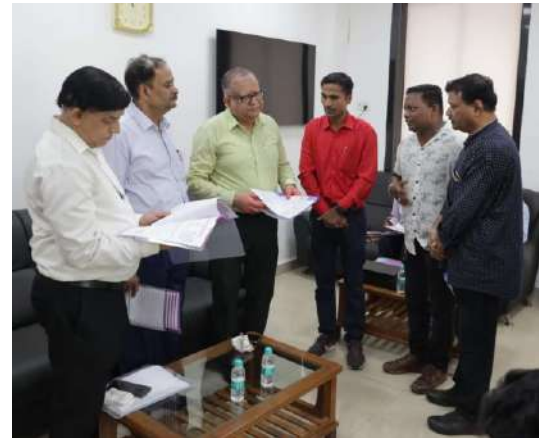
EMU – POH Branch handing over Memorandum to General Manager.