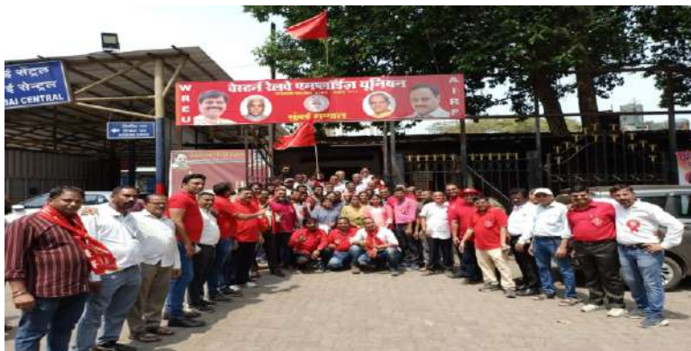
Large number of leaders and activists of Coach Care Unit, BCT joined WREU.