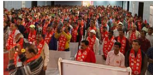
HMS-Gujarat State AGM and HMS Platinum Jubilee celebrations at Vadodara.