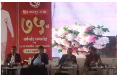
← 34th Triennial Convention and Platinum Jubilee Celebration of HMS at Nagpur.