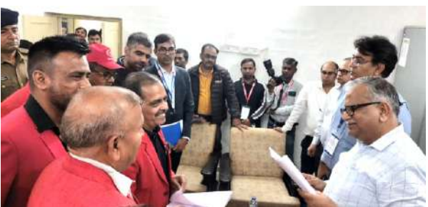
WREU-ADI handed over Memorandum to General Manager.