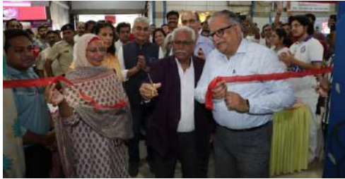
General Manager inaugurated Blood donation camp at Churchgate on 1st March 2024 and donated blood voluntarily.