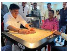
→ Car shed Branch-Mumbai organized Carrom Tournament

Printed and published by JAYAWANT R. BHOSALE on behalf of Western Railway Employees' Union, and Printed at Vijay Copy Centre and Published by WESTERN RAILWAY EMPLOYEES'S UNION , Grant Road Station Building (E), MUMBAI - 400 007.