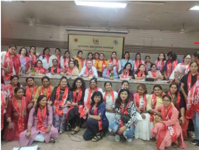
A Group Photo of National Wellbeing Seminar at New Delhi.