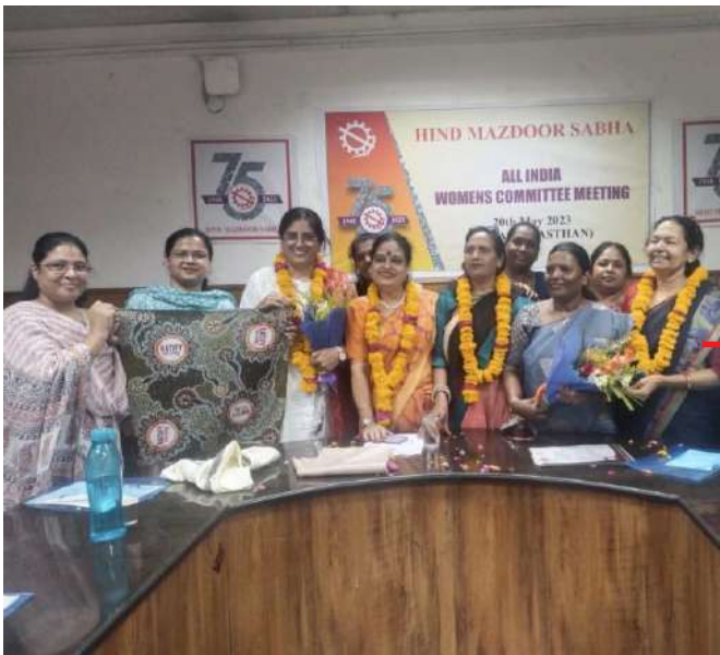
All India HMS Womens Committee Meeting held at Kota, Rajasthan on 20th May 2023.