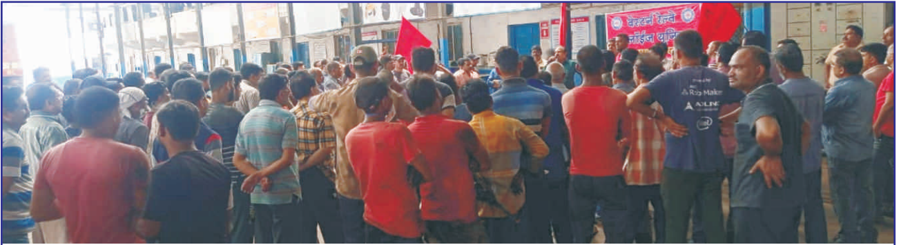
Huge demonstration in TRS shed Valsad