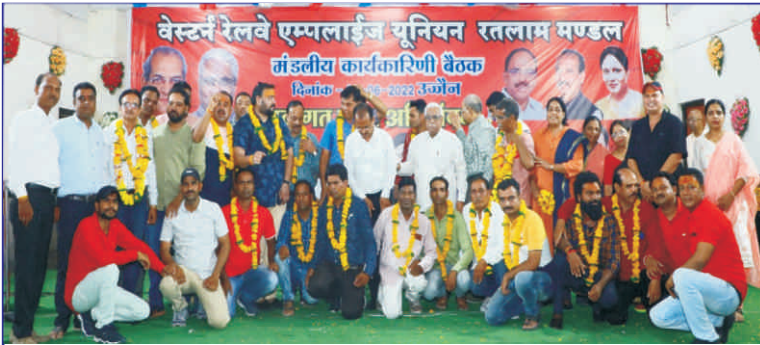
General Secretary felicitating the leaders and comrades of WREU Ratlam and of Ujjain Branch on 20.06.2022