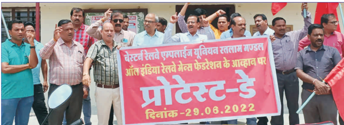
Protest against the "AGNIPATH Scheme" by Ratlam Division