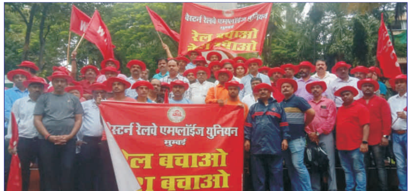
Leaders and activists of HMS Maharashtra and WREU at August Kranti Maidan on 9th August, 2022