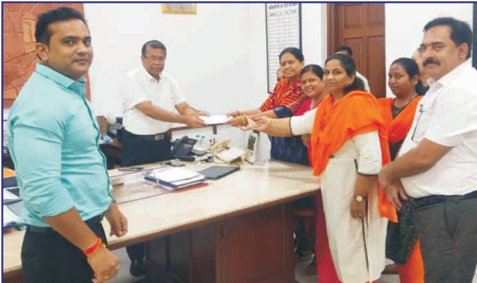
Submission of Memorandum to DRM BRC by Women Wing of WREU BRC