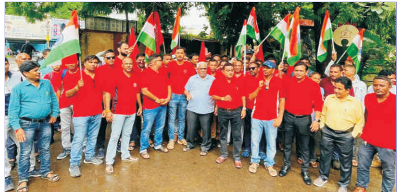
Youth Rally & Tiranga yatra by WREU BRC Division