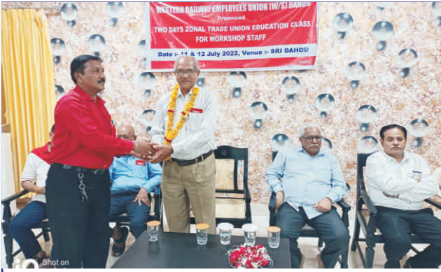
Zonal Trade Union Education Programme for Workshop Staff at Dahod on 11 & 12 July, 2022