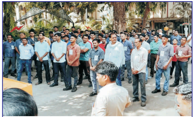
Huge gathering at BRC Yard.