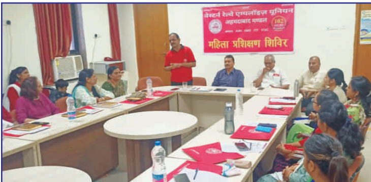
Training Camp for Women Employees by WREU Ahmedabad Division