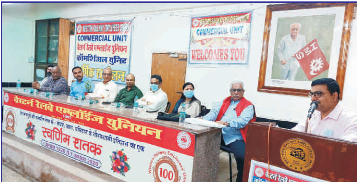
Annual Get together by Commercial Unit BCT Division