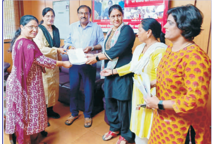
Submission of Memorandum to DRM Ratlam by Women Wing of WREU RTM