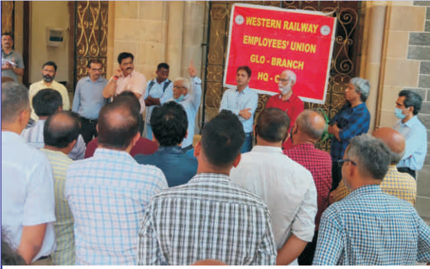
Protest meeting at GM office against surrendering of vacant posts on 14.06.2022.