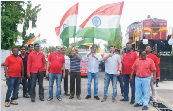
Tiranga Yatra by BL I & II Branches