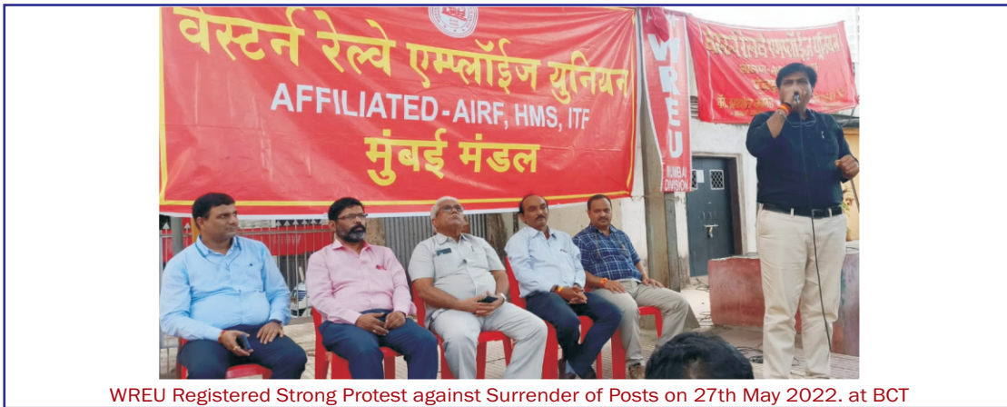
WREU Registered Strong Protest against Surrender of Posts on 27th May 2022. at BCT