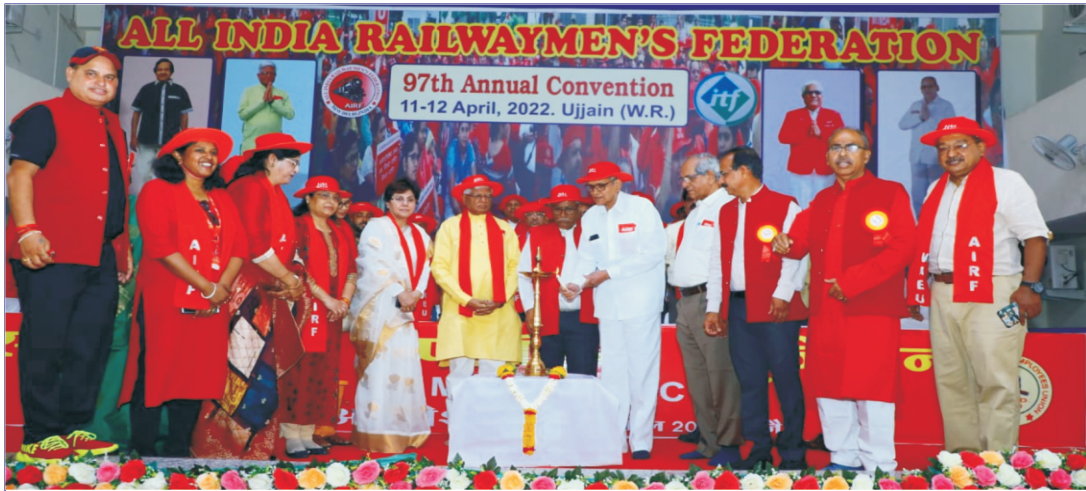
Innagation of WREU 101st AGM at Ujjain