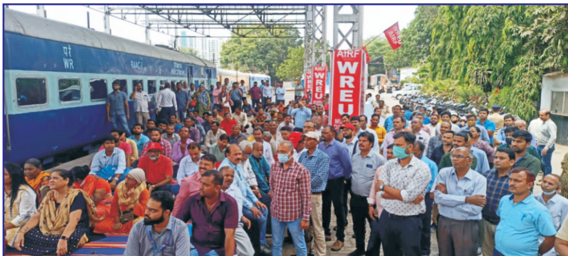
A Photo of Huge Demonstration at DRM Office, Mumbai