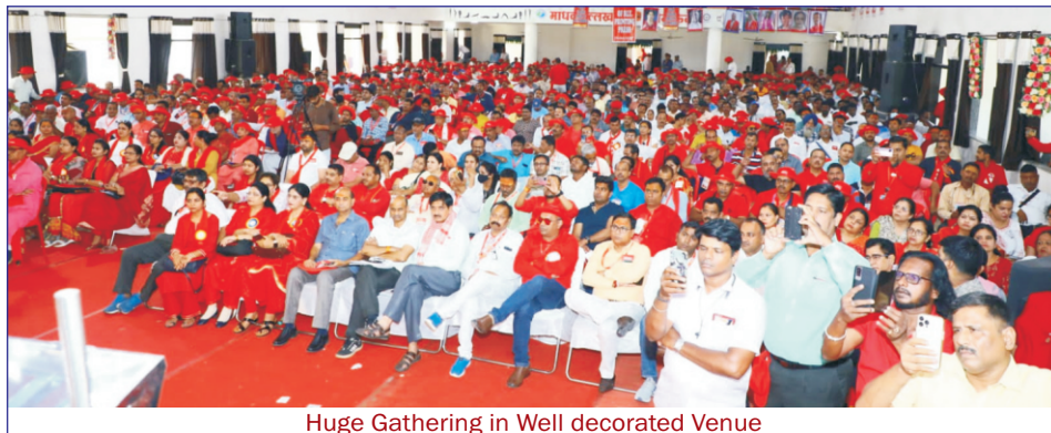
Huge Gathering in Well decorated Venue