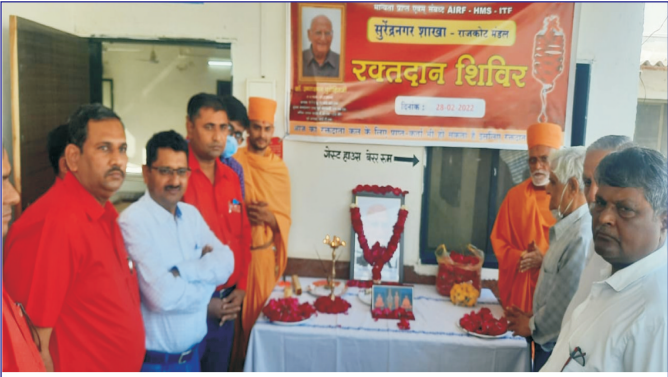
Blood Donation Camp at Suredranagar - RJT Division