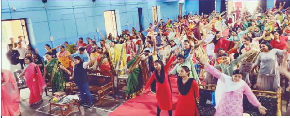
International Womens Day - BRC Division Participants attending Fitness and Health Session