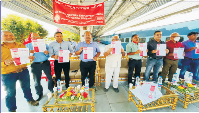
Blood Donation Camp and Union Patrika Vimochan at BRCP on 2nd March