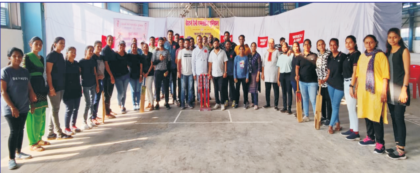
Cricket Tournament at Virar Carshed Organised by BCT Carshed Branch on 24th & 25th February 2022.