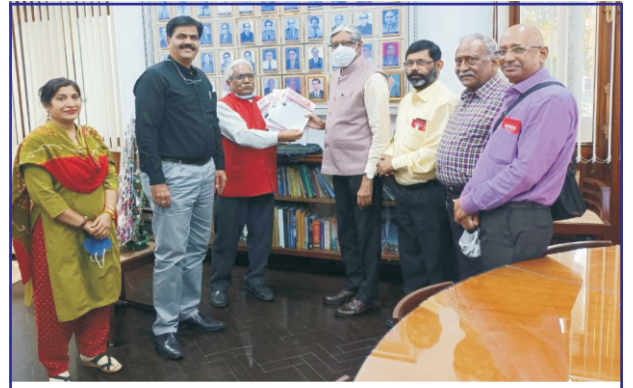
WREU Delegation Welcoming General Manager