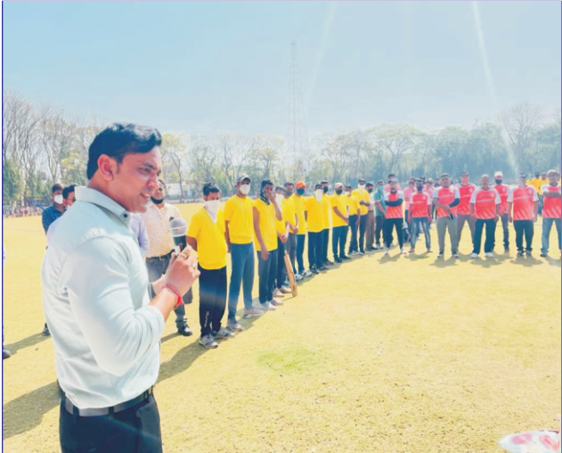
Com. U.M. Purohit Tournament at BRC