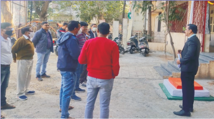
Republic Day Flag Hosting at BRCP Union Office and WREU Union Office (Menon Bhawan) at Bhavnagar