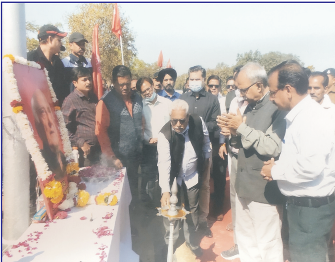
Opening of Tennis Ball Tournament at RTM by GS/WREU