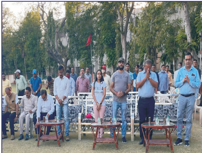
Opening Session of 11th UPCL at BRC.