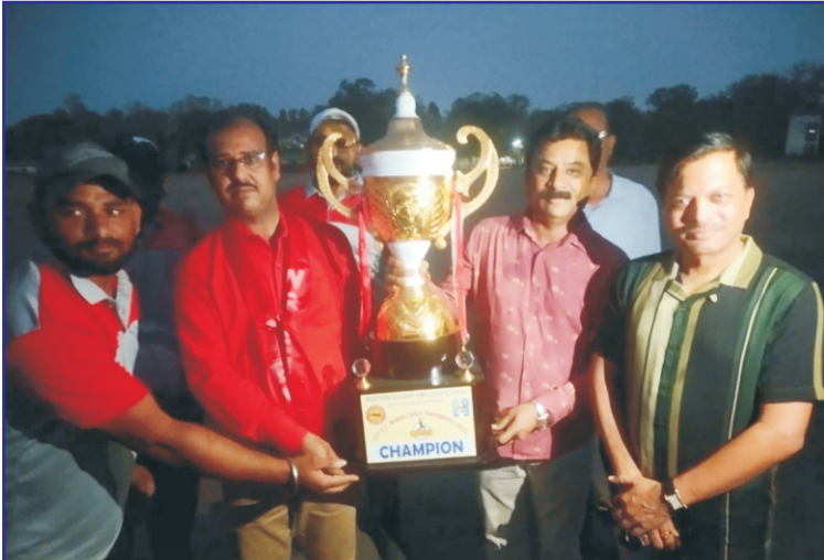
Prize Distribution of Menon Cup Cricket Tournament at BVP