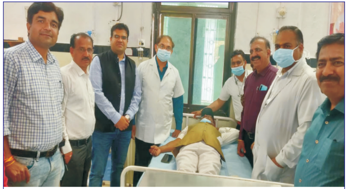
Blood Donation Camp at Divisional Railway Hospital Ratlam