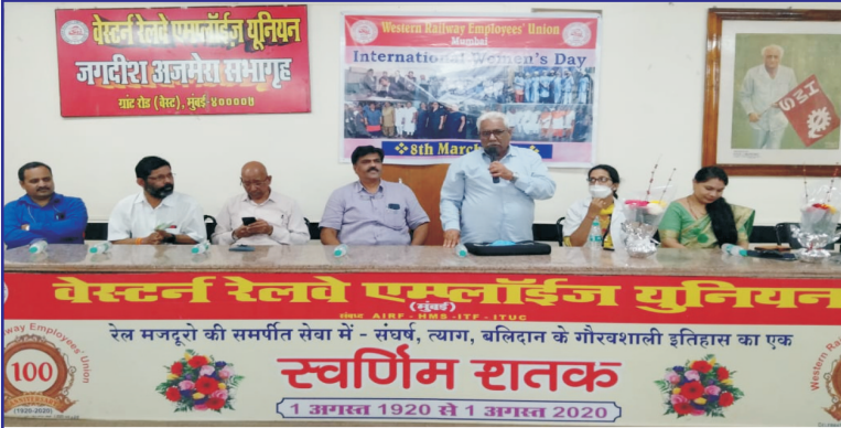
International Womens Day Celebration at Grant Road - Mumbai