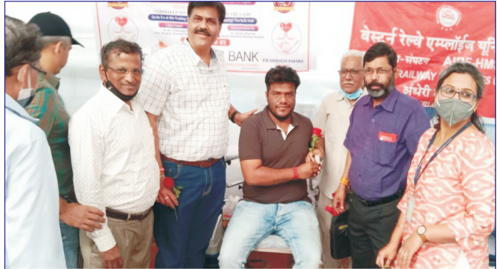
Blood Donation Camp at Andheri Station - BCT Division