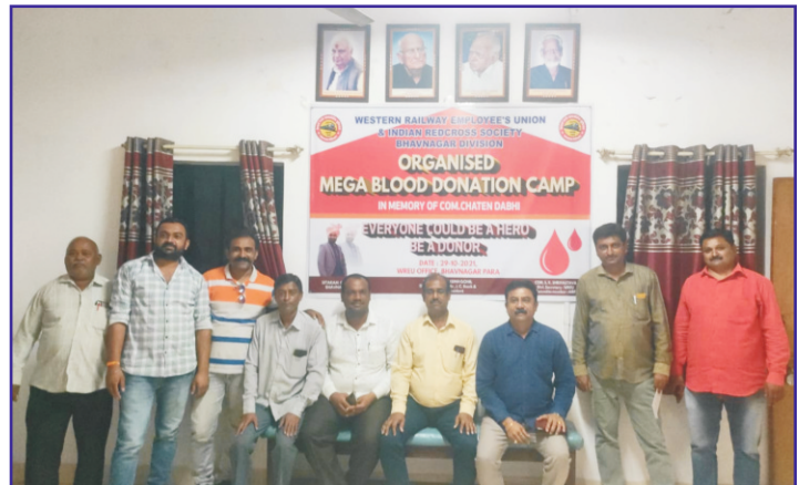
Mega Blood Donation Camp at BVP