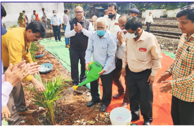
Tree Plantation at Dadar by WREU