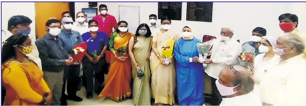
DOCTORS DAY - WREU Extends its Gratitude in Jagjivanram Hospital on 01-07-2021.