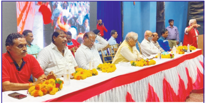
Youth Conference at Vadodara on 09-10-2021