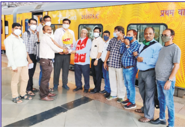
Greetings to Working President AIRF at Mumbai Central On 27-07-2021