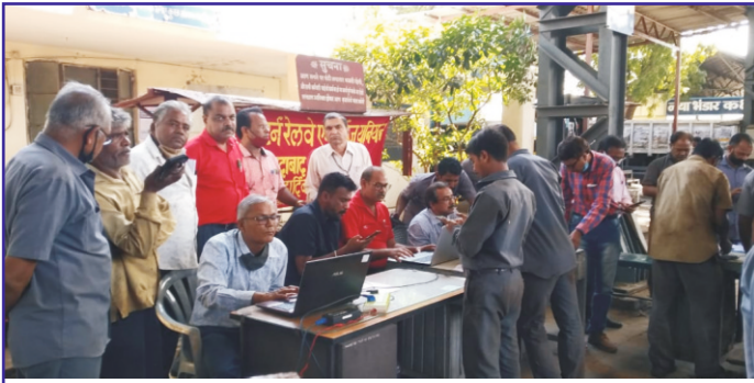
HRMS Camp by WREU - ADI