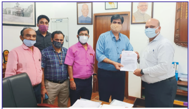
Memorandum to DRM-BCT by WREU on 29-09-2021