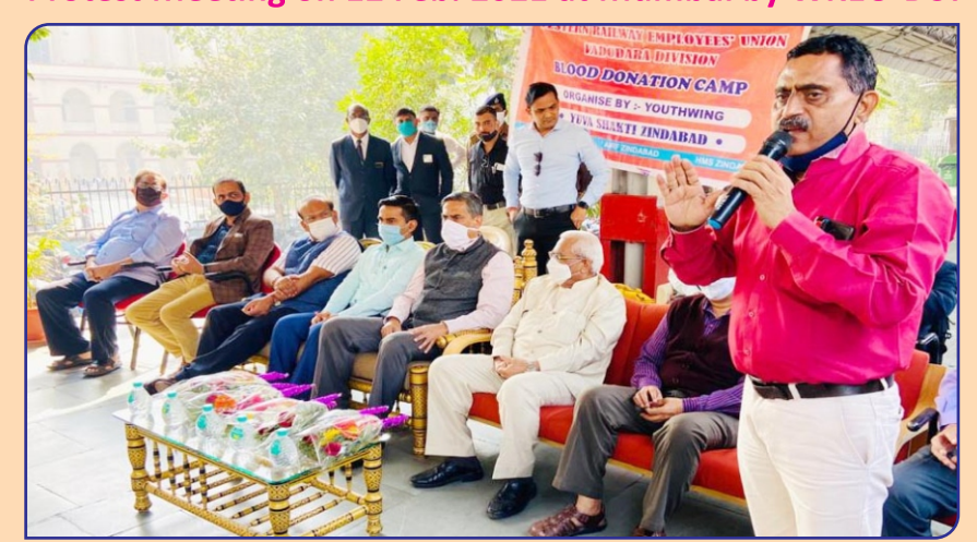
Blood Donation Camp at Vadodara-P by WREU-BRC