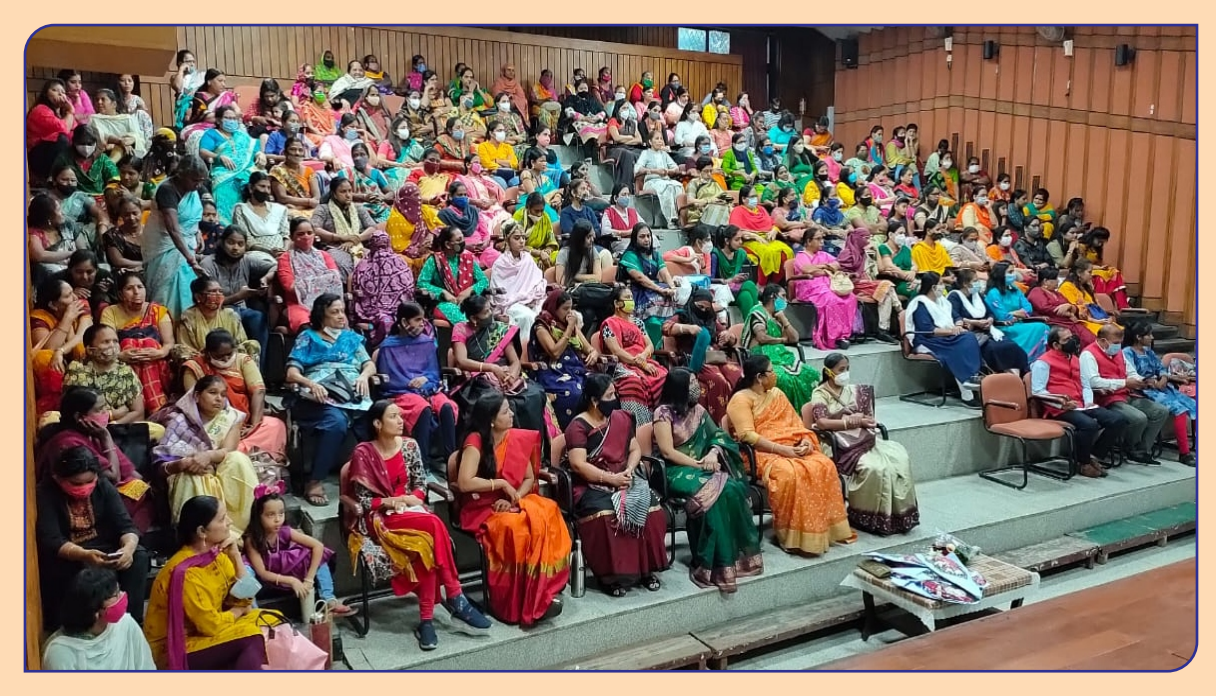
Celebration of International Women's Day - 2021 by WREU-ADI