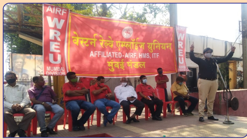
Protest Meeting on 12 Feb. 2021 at Mumbai by WREU-BCT