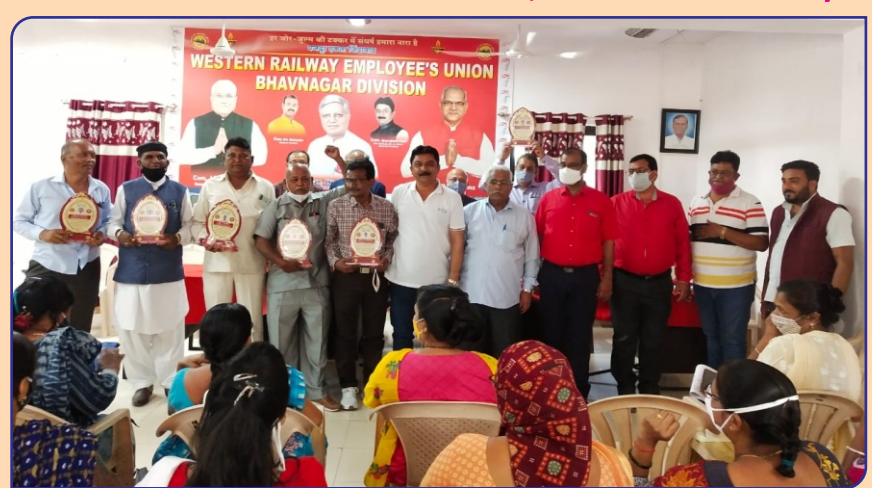
Retirement function of Comrades of WREU-BVP